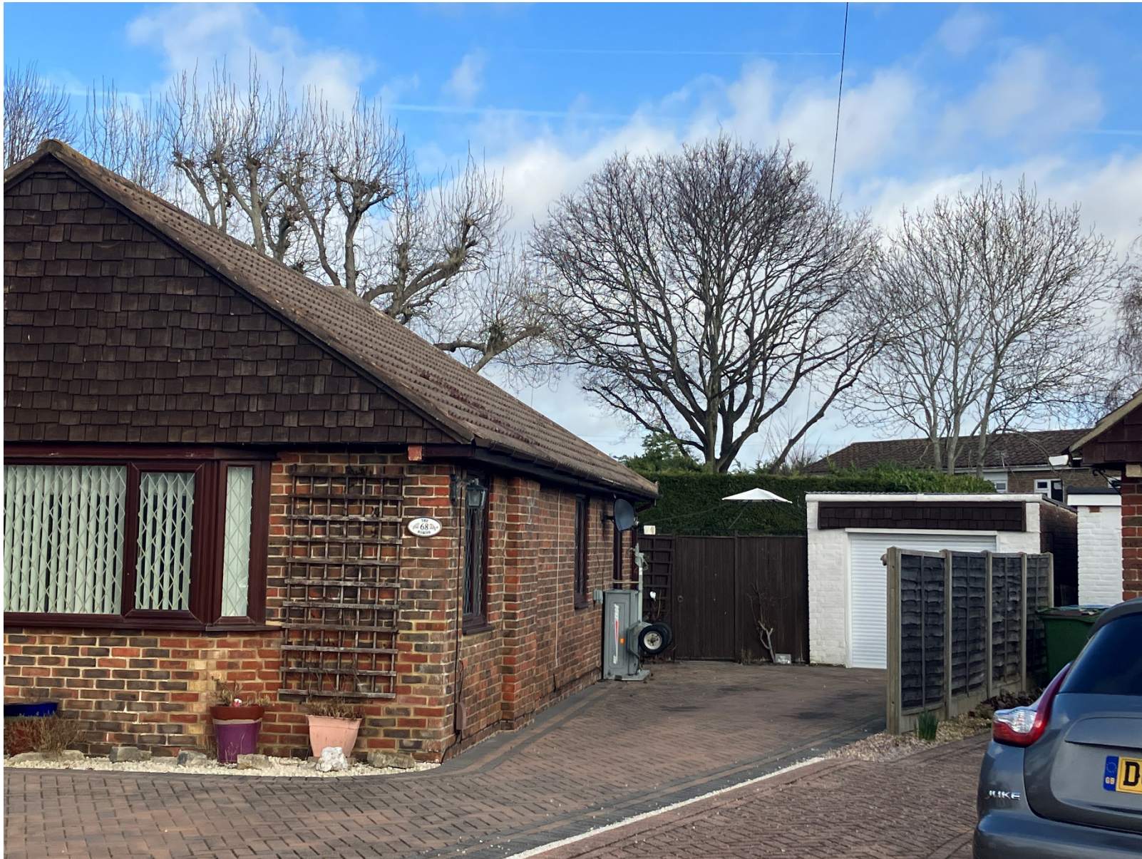
3. View of oak (centre tree) from Green Road looking north-east