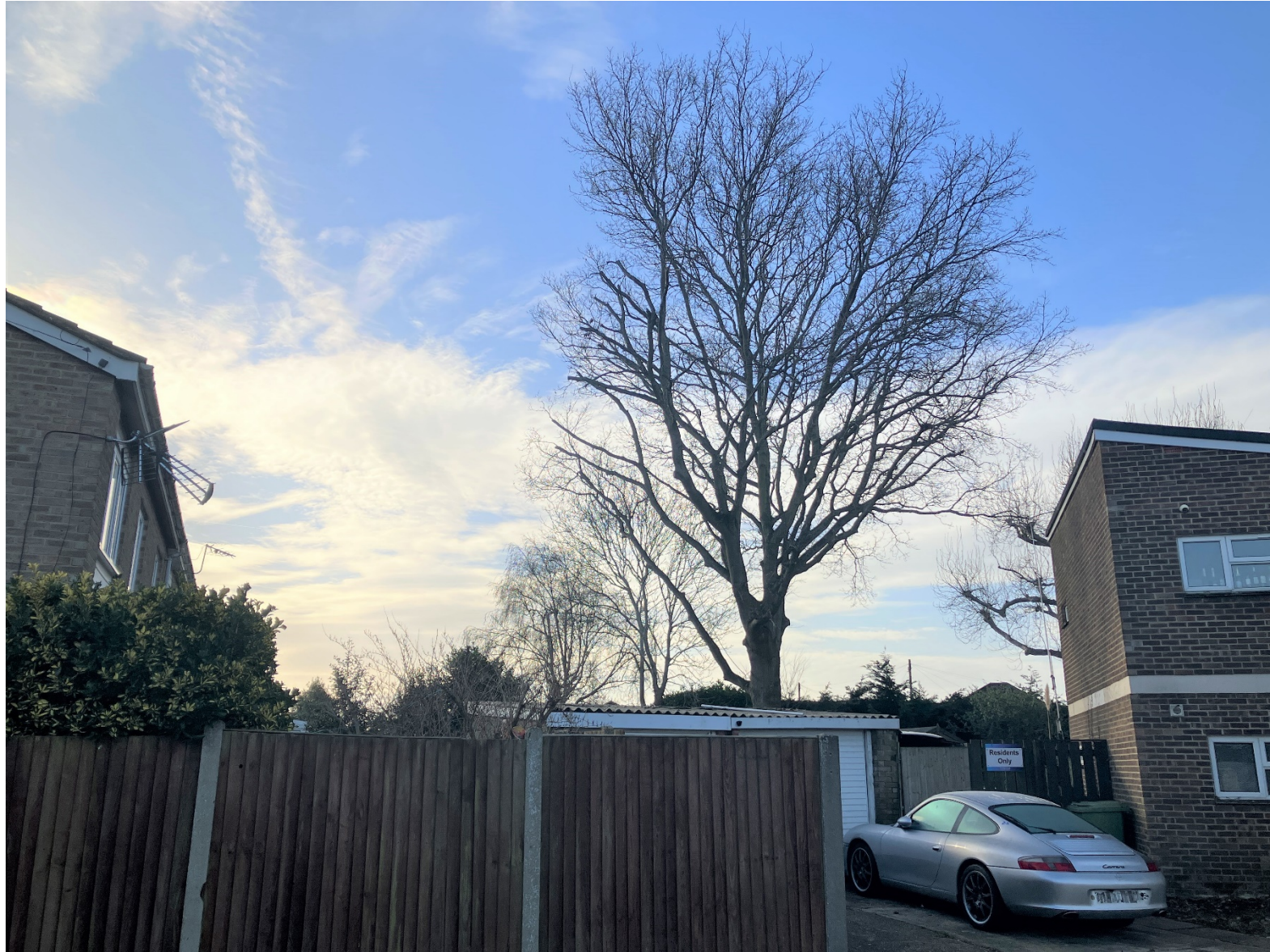
1. View of oak from Foster Close looking south