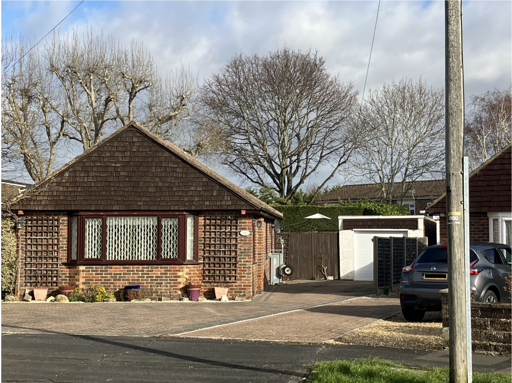
4. View of oak (centre tree) from Green Road looking north-east