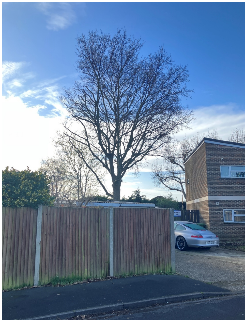
2. View of oak from Foster Close looking south